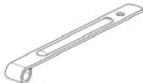
Current version - 005B7028

Replacement of the moving blades reference 005B7028 by the moving blades reference 68 7502 18 used on another relay series.